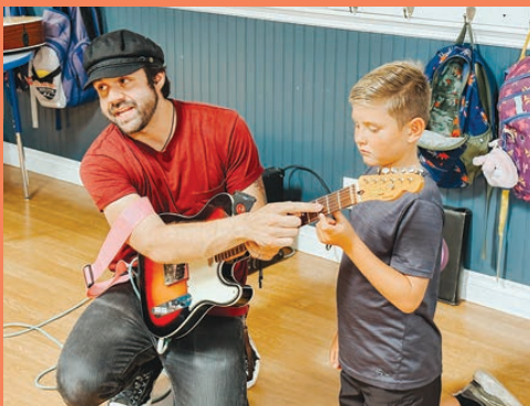
Boys & Girls Clubs of San Dieguito, located in California, was awarded a USD 5,000 grant to support summer camp programming for under-resourced youth.

MDRT members formed the MDRT Foundation to support causes they are passionate about and to represent the caring spirit of the financial services profession. For more than 65 years, the MDRT Foundation has been committed to supporting charities that MDRT members select. Since 1959, the MDRT Foundation has awarded more than USD 42 million in grants in all 50 U.S. states and more than 70 countries.