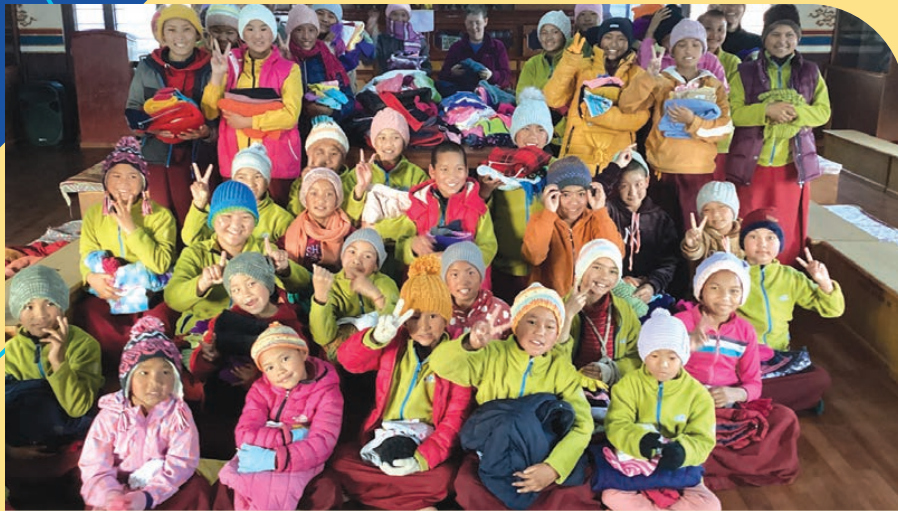
Altevette Project, a school in Upper Mustang, Nepal, that provides accommodations and education to girls in the local areas, was awarded a USD 4,000 grant to teach computer skills and purchase seven personal computers.