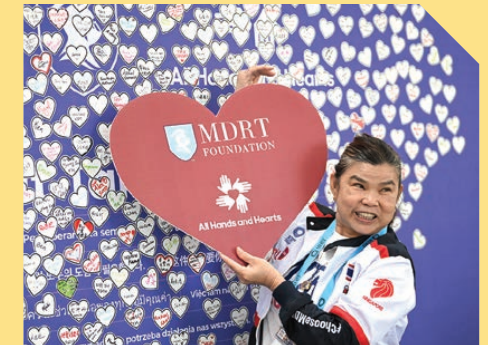
An MDRT member at the Annual Meeting posing with the MDRT Foundation "Heart Wall," which showcases member donations.

All Hands and Hearts (AHAH) is a charitable organization committed to effectively addressing the immediate and long-term needs of global communities impacted by disasters. AHAH arrives early for first response and stays late to rebuild schools and homes in a disaster-resilient way. During the Annual Meeting, MDRT members raised more than USD 106,750 for AHAH and also registered volunteers for the program.